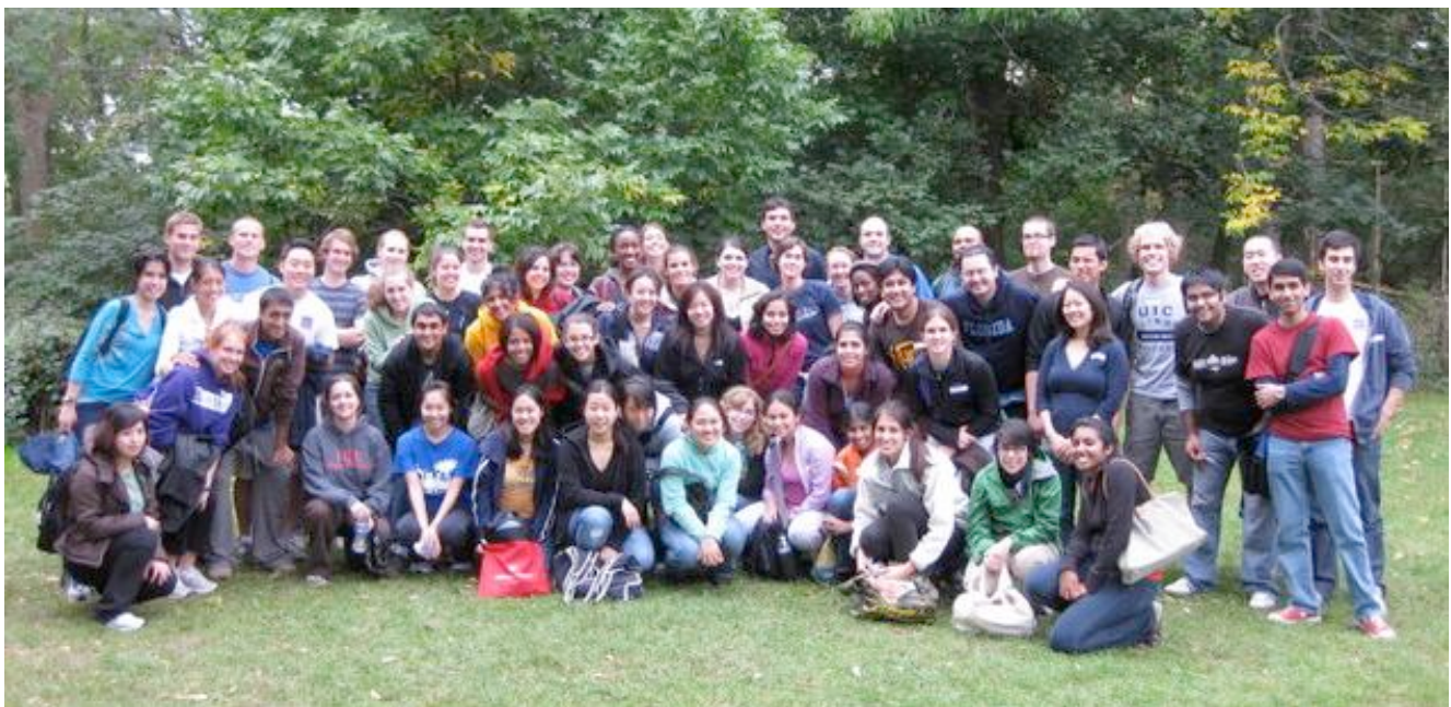
Participants in last year’s Fall Leadership Retreat, held in Williams Bay, WI.

*ALL PASSPORTS AND APPLICATIONS ARE DUE FRIDAY, APRIL 1, 2011.*